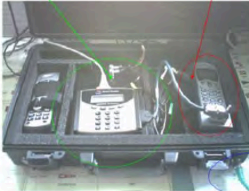
IRIDIUM Satellite Telephone